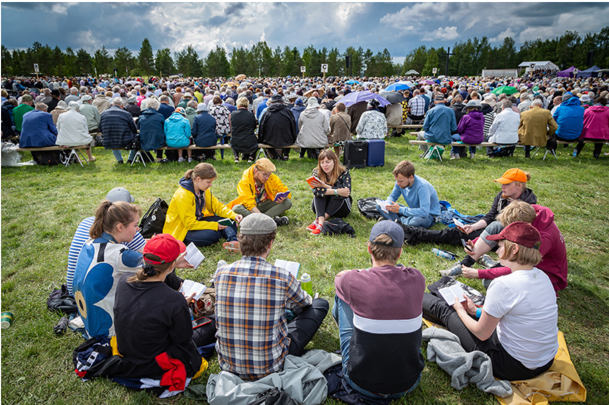
The Awakening Festival brings together tens of thousands of people each year to sing hymns.