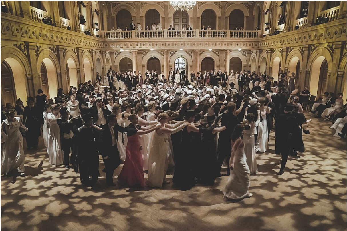
The conferment of master’s degree graduates involves many days of celebrations. Grande Maccaroni being danced at the Old Student House in Helsinki.