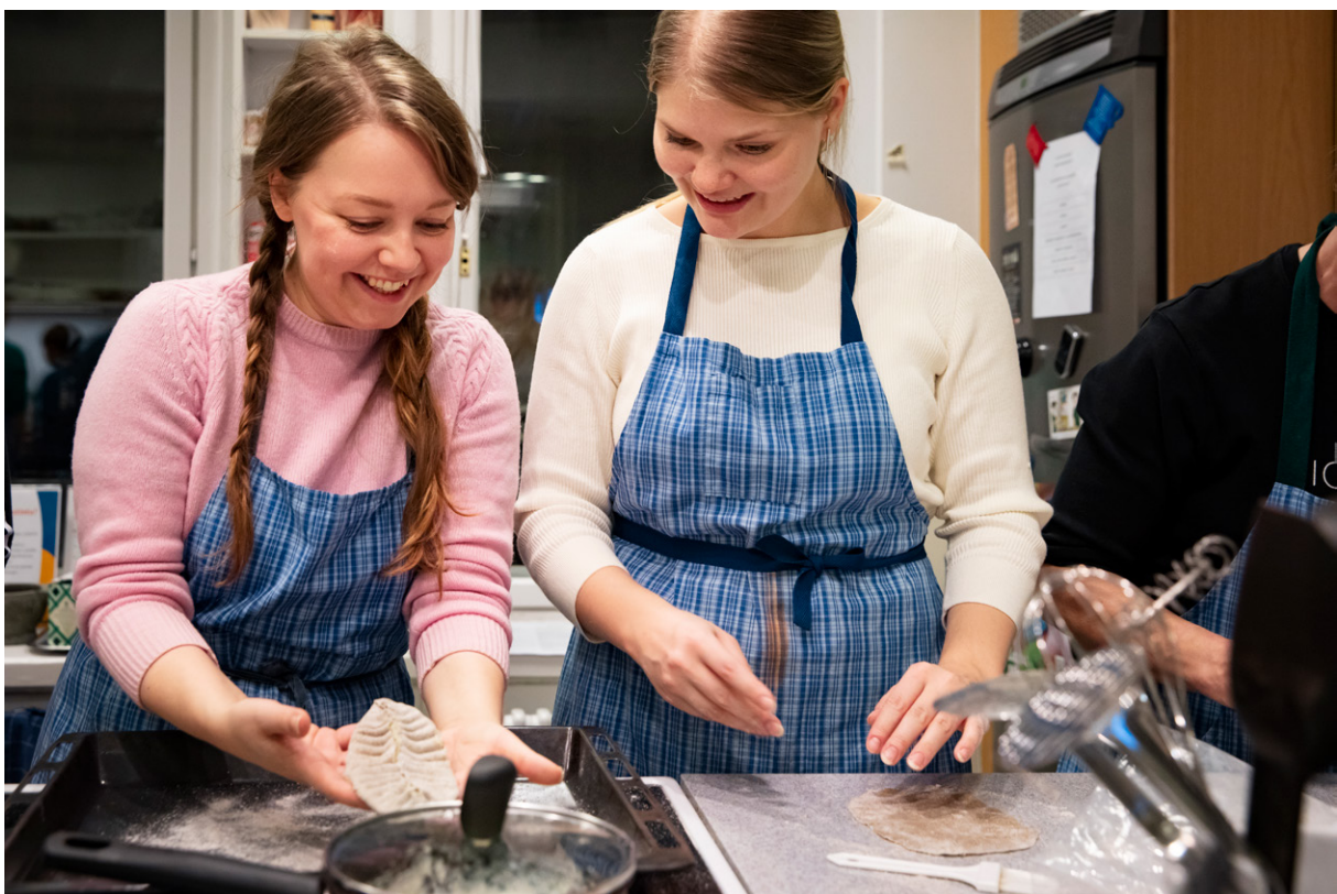
Karelian pastries being baked at a workshop of the Uusimaa branch of the Martha Organisation.