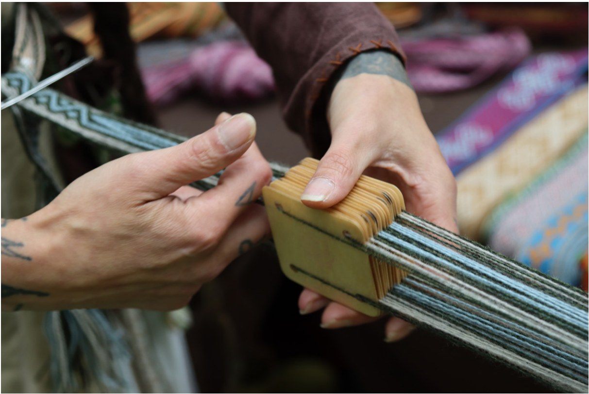
Yarn braiding during the Helsinga Medieval Day.