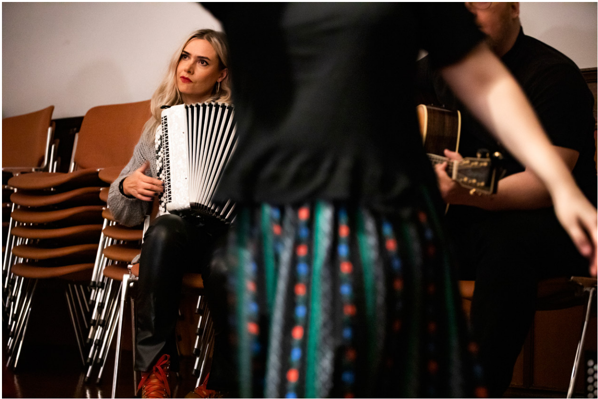
The folk dance jams feature dancing to the tune of an accordion and guitar in Helsinki.