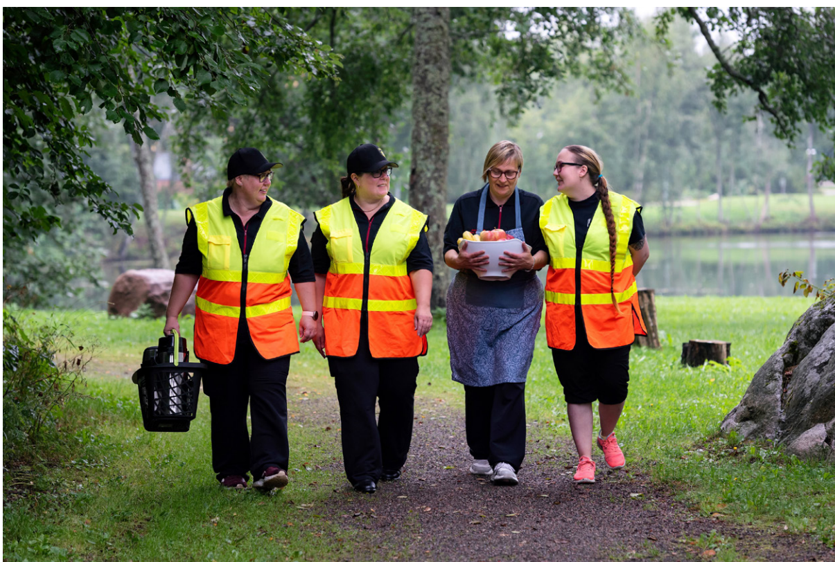
More than 30,000 people throughout Finland are involved in volunteer fire brigade activities. Rescue-related expertise is transferred from one generation to the next.