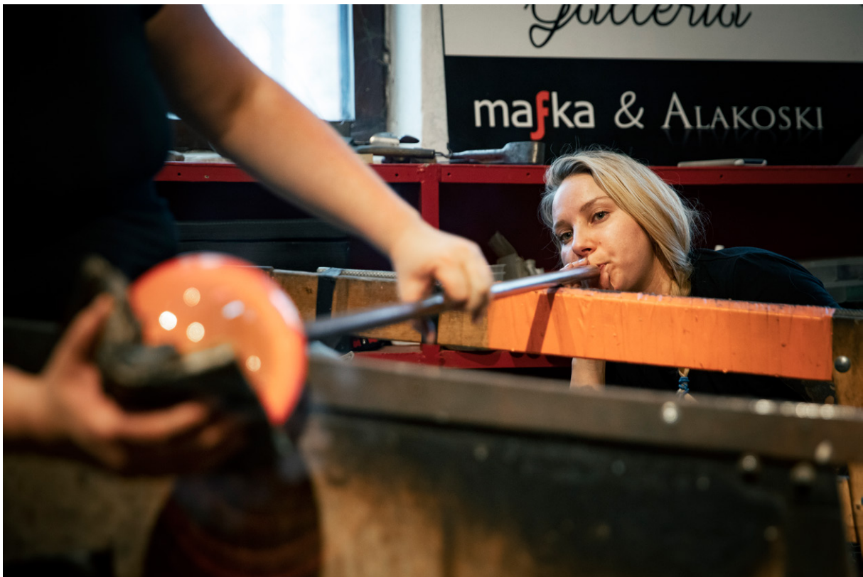
Knowledge, skills and techniques related to hand-blown glass were added on the UNESCO Intangible Cultural Heritage List in 2023 by Finland and four other countries.