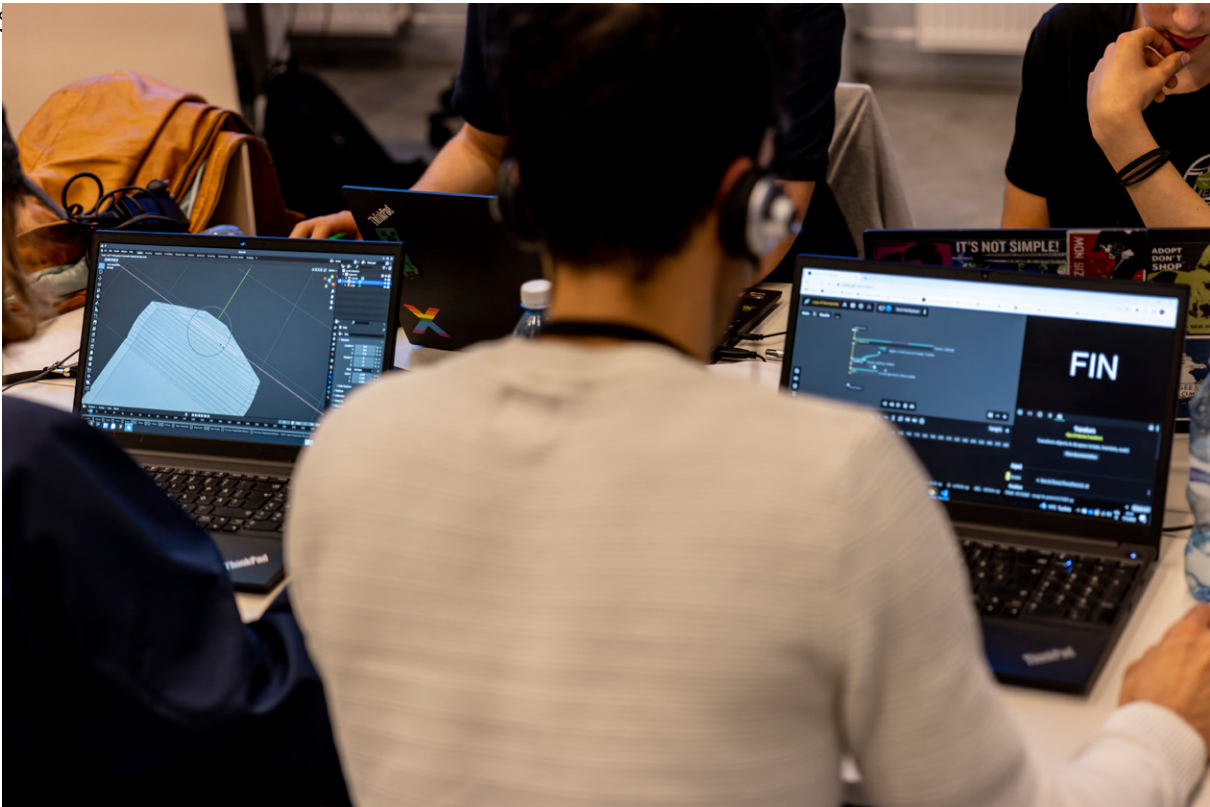
A Demoscene workshop at the Finnish Museum of Games at Vapriikki in Tampere.