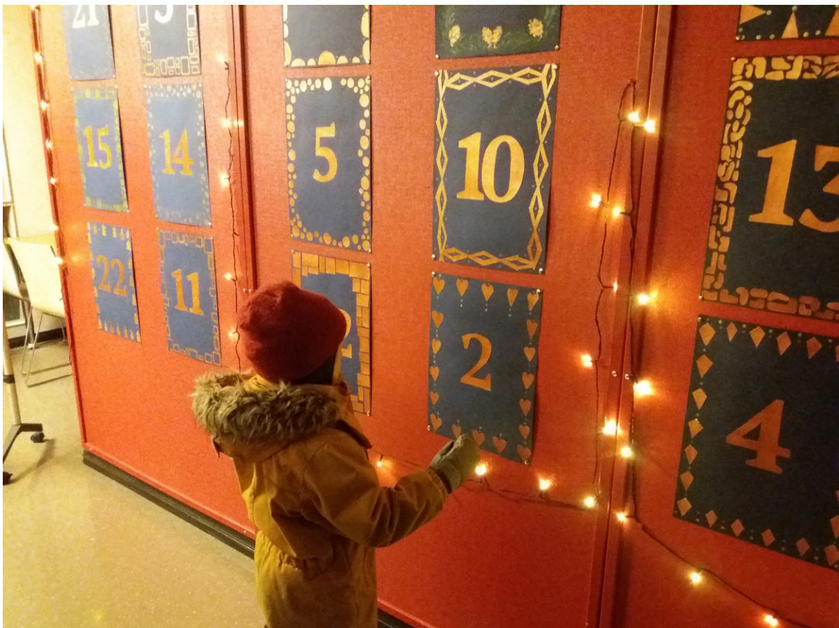
The living Christmas calendar of Käpylä brings local people together.