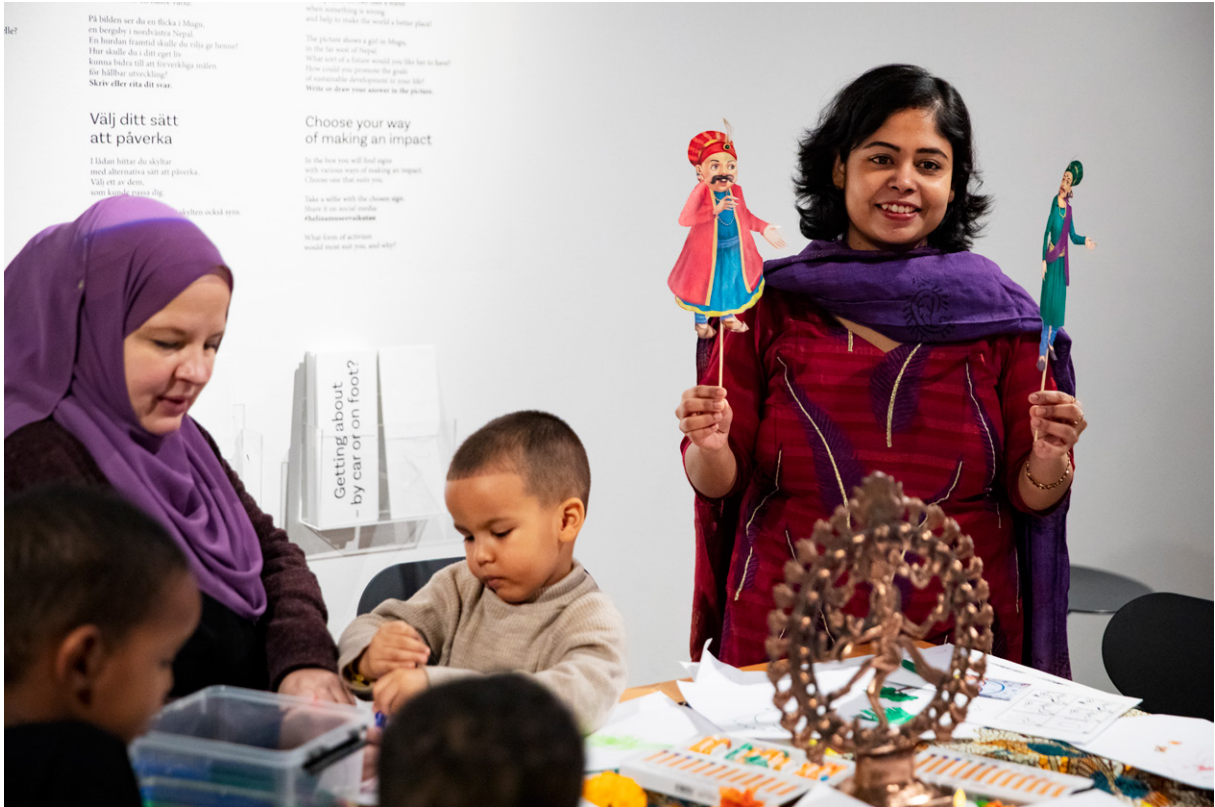
The fairy tale workshop 'Winter Trip to India' at the Helinä Rautavaara Museum in Espoo.