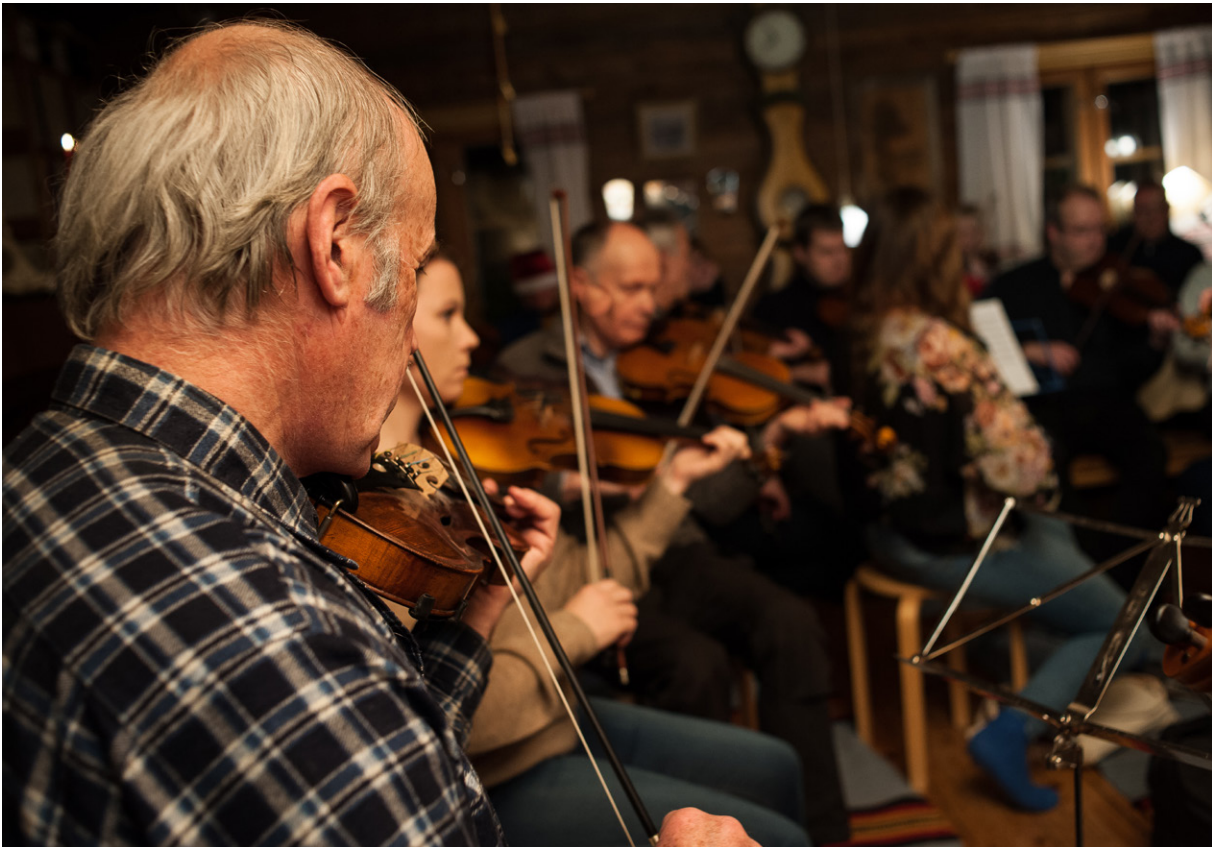
The Kaustinen fiddle tradition was added to the UNESCO Intangible Cultural Heritage List in 2021.