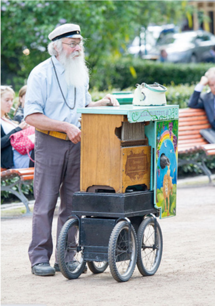
There are a few dozen barrel organ players in Finland.