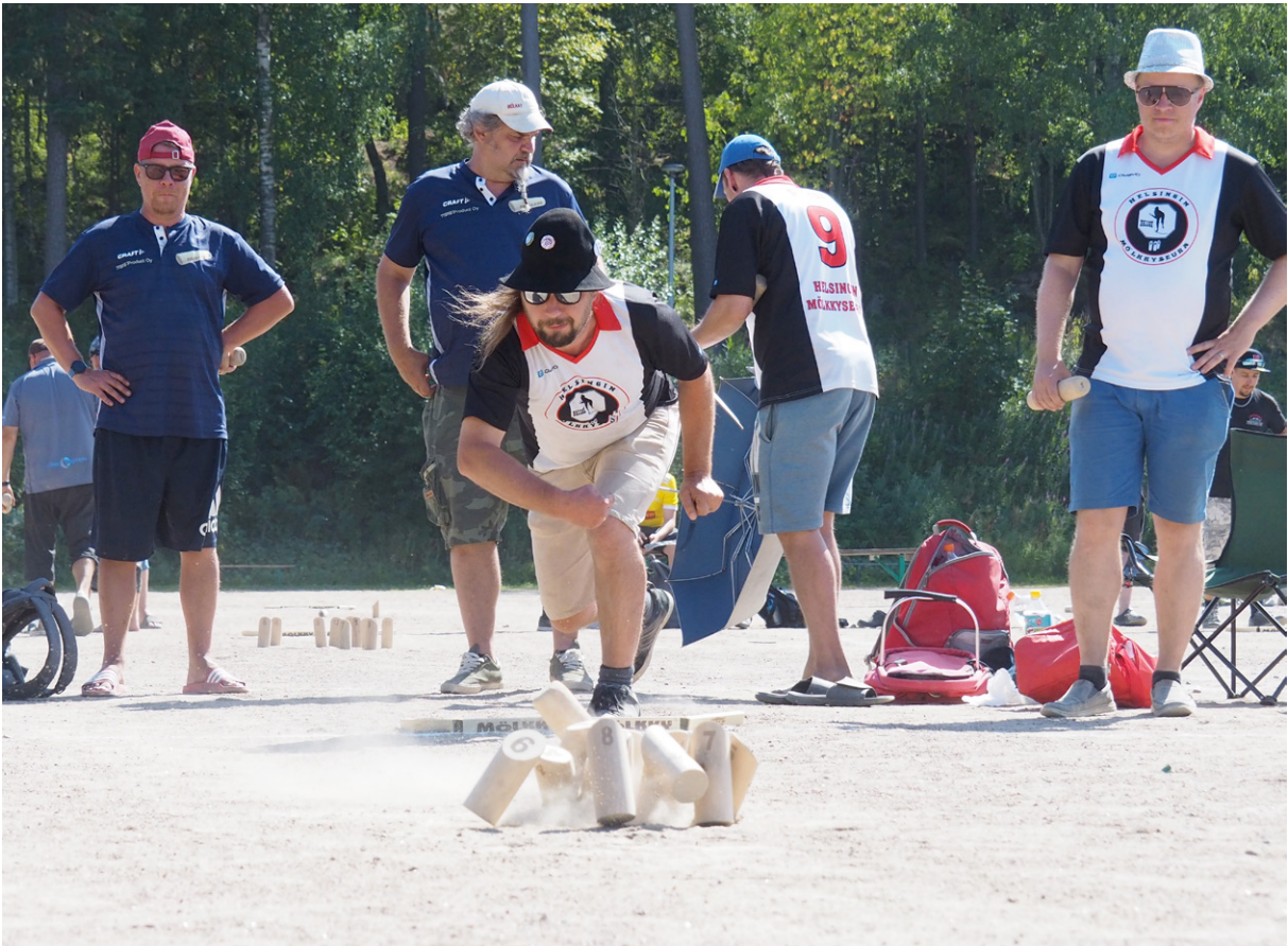
The Mölkky game has gained much popularity in recent decades.