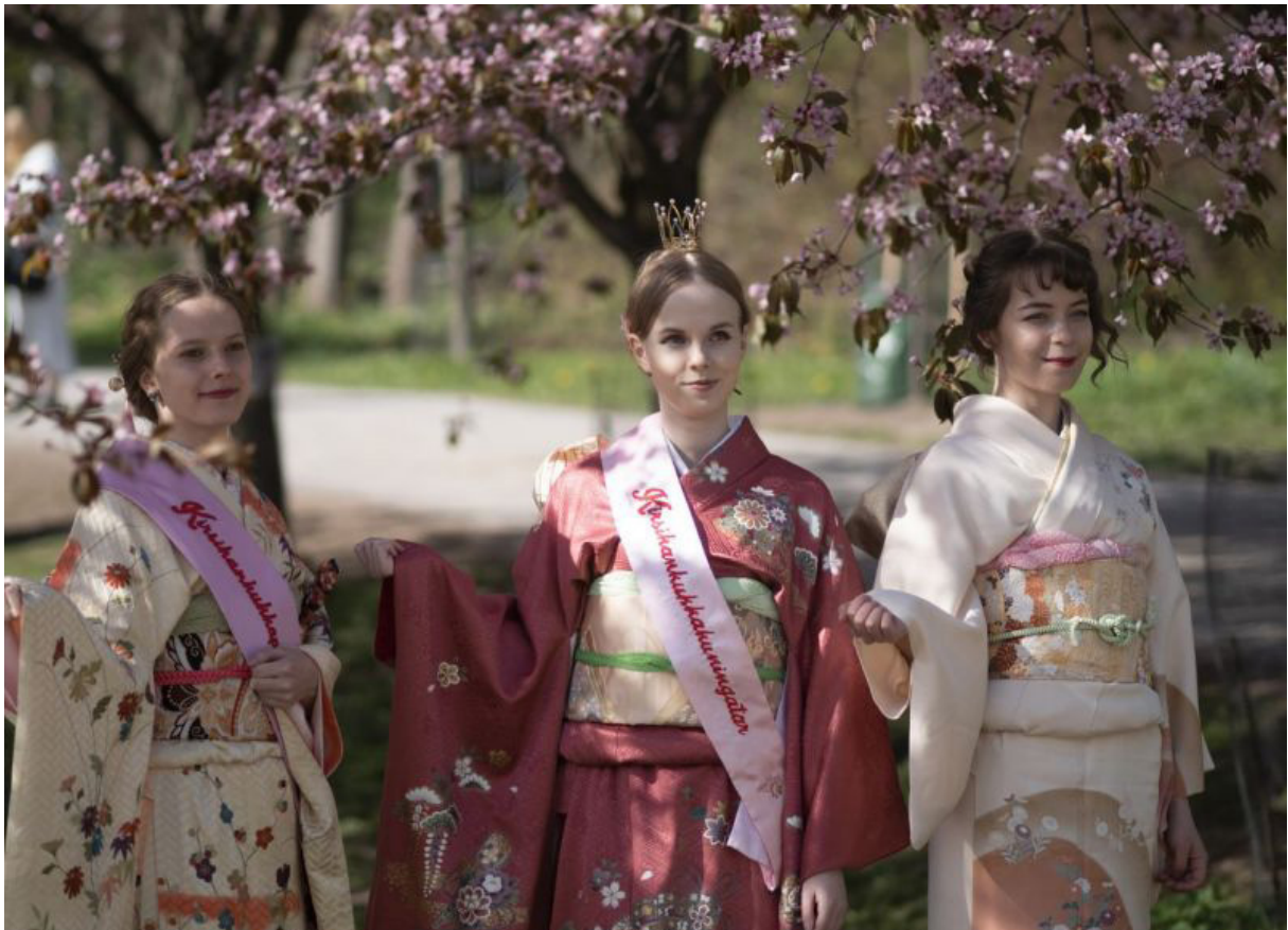
The Japanese Hanami Festival is celebrated in Finland, too, when cherry trees are in bloom.