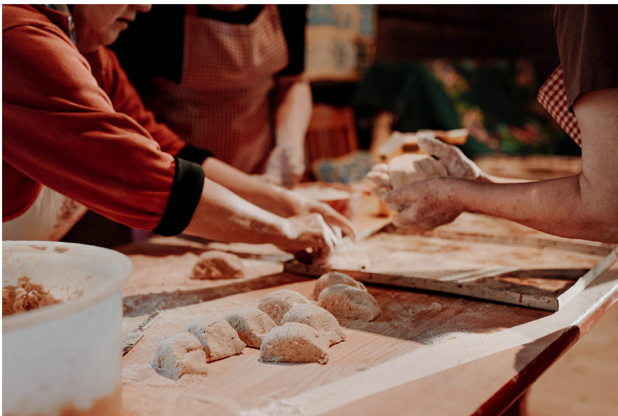
Baking is living tradition in our day-to-day lives.