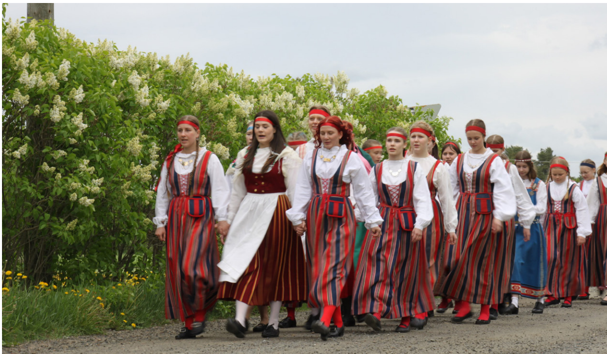
Maidens blessing the harvest through song during the Whitsunday festival in Ritvala. The festival has been celebrated for centuries.