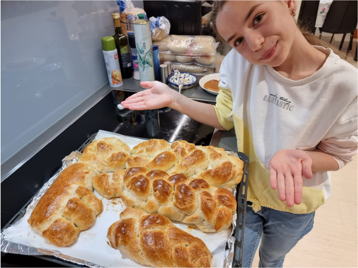
The Challah bread is an important traditional food in Jewish culture.