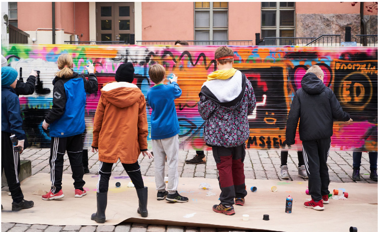
Graffiti is an important form of self-expression for many young people. The phenomenon, which is encompassed by hip hop culture, can already be regarded as a tradition.