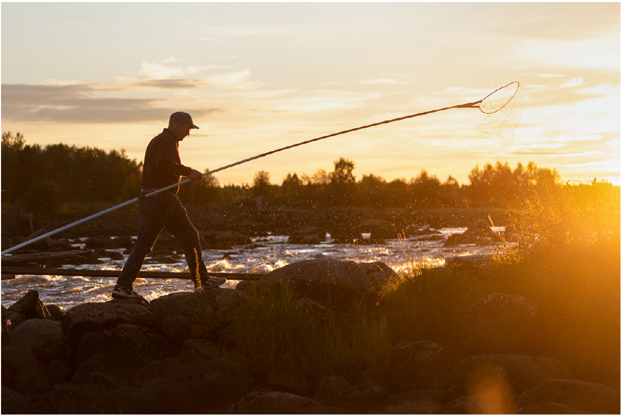
Finland and Sweden are applying for the addition of the Torne River Valley “lippo” dipnet fishing culture on the UNESCO list.